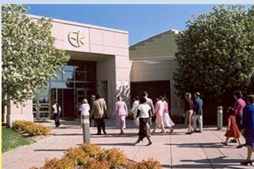
Temple of ECK, Chanhassen, MN eckankar.org/Temple